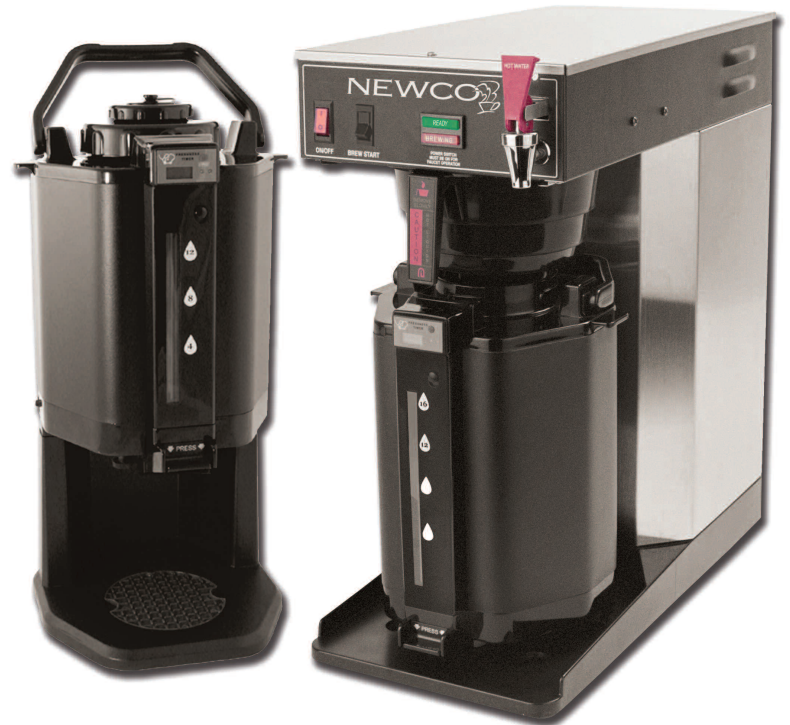
dispenser not included

All the features are built into a stainless steel cabinet for long stability and durability.