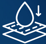
Reverse Osmosis Membrane

Reduces dissolved solids, pharmaceuticals, and metals.