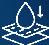
Reverse Osmosis Membrane

Reduces chlorine, chemicals, and pesticides.